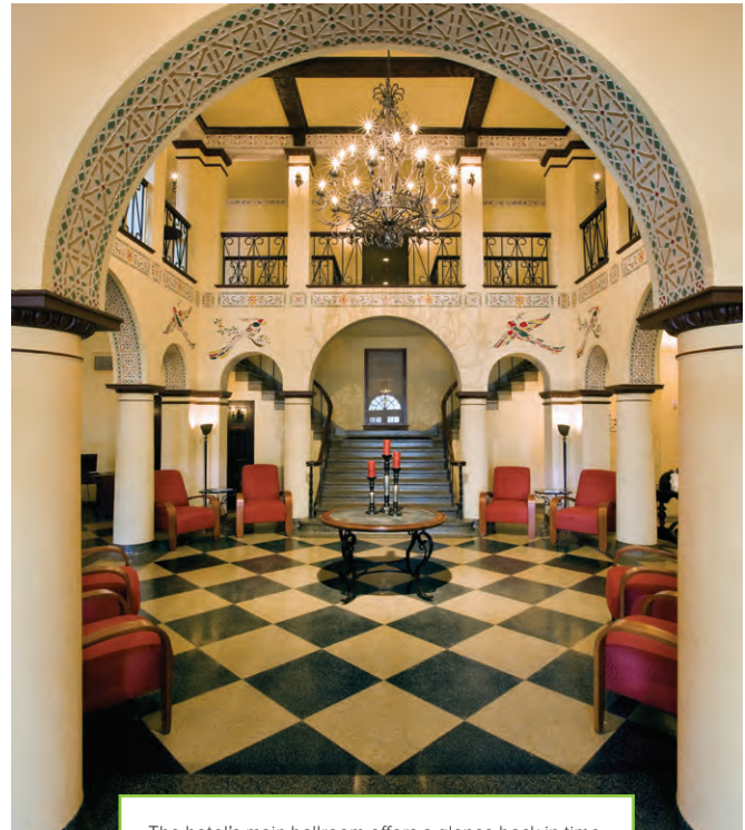
The hotel's main ballroom offers a glance back in time.