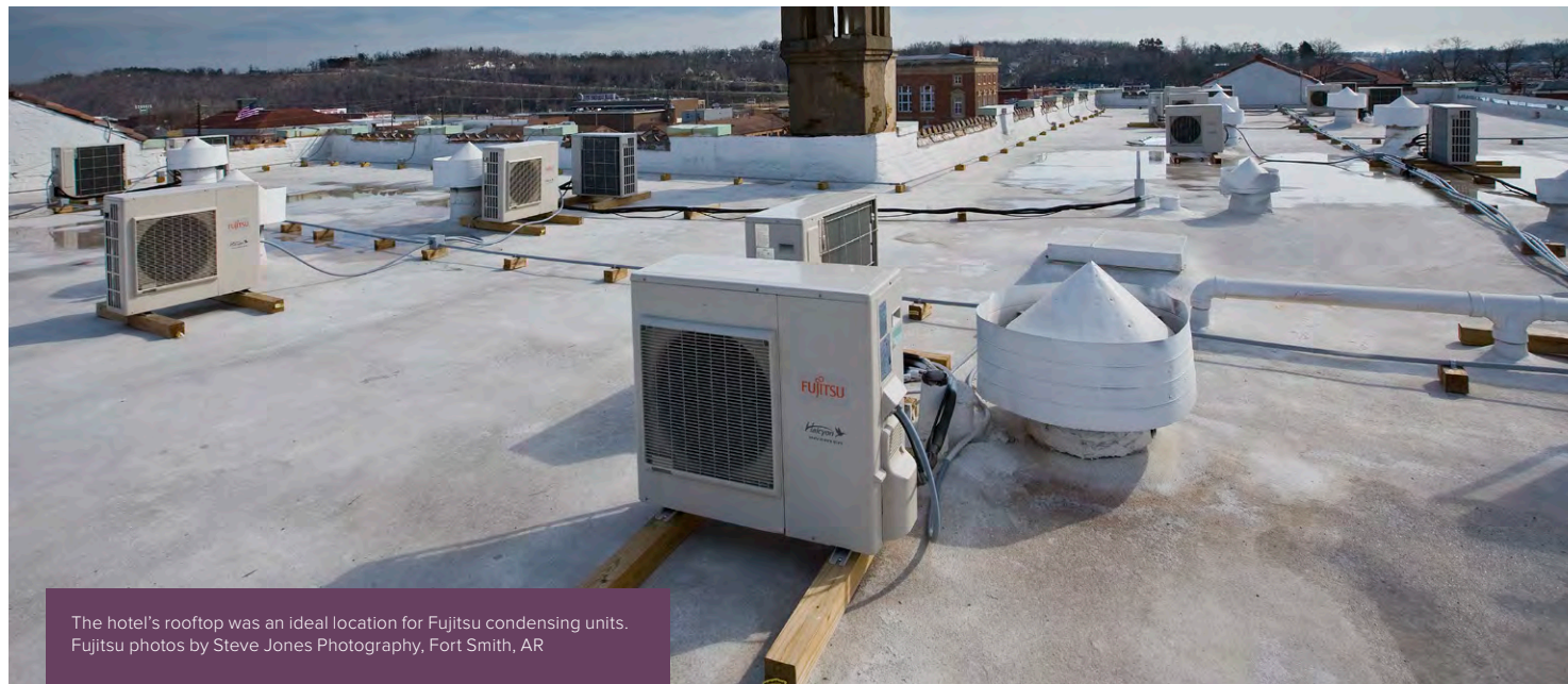
The hotel's rooftop was an ideal location for Fujitsu condensing units.