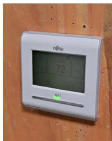
All apartments are provided individual zoning provided by Fujitsu controls

With assistance from Ferguson's VRF Division, Darnold Mechanical installed and commissioned the systems between December, 2021 and August, 2022. Data captured during commissioning was sent to Fujitsu for review.