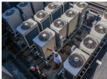
The larger of the two condenser farms is located in the rooftop well that once housed the building's cooling towers.

"The system includes 21 refrigerant circuits in all," said Howell. "We try to optimize around 20-ton systems because they provide the most value for tonnage. The smallest system here is 12 tons."