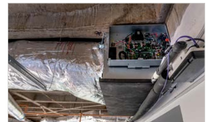
High-static air handlers were installed in larger apartments, the downstairs atrium, and office areas.