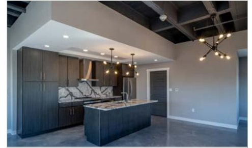
AB Contracting is known for creating exceptional living spaces, as indicated by the comfort level and quality of finishes inside 900 on Lee.

That vision included new office space on the lower floors with apartments occupying all levels above.