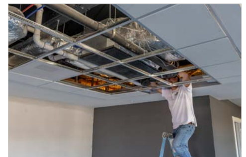
Sheet metal worker Spencer Faber connects ductwork to a high-static air handler.