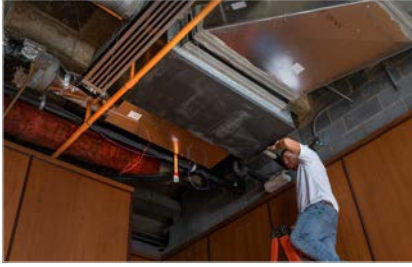
Spencer Faber installs Fujitsu's ARUH high-static air handler.

The building's floorplan is served by a variety of terminal unit types. Slim duct air handlers were installed in corridors and